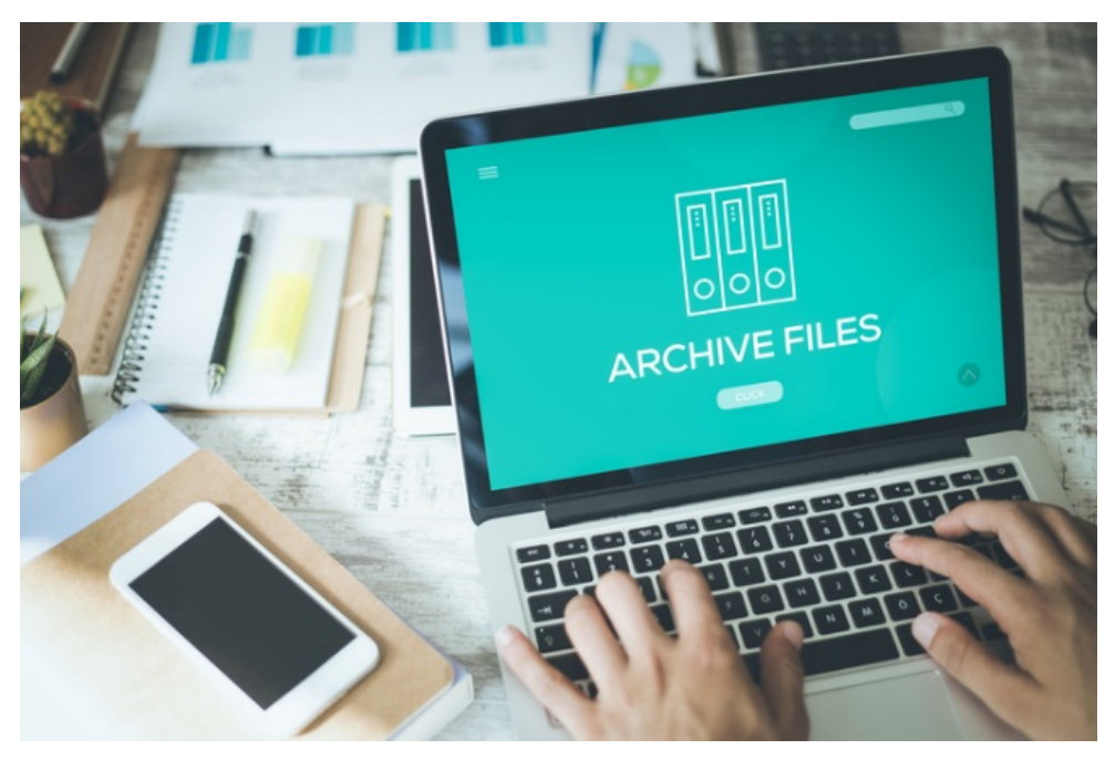
24/7 access to your secure online ERISA documents